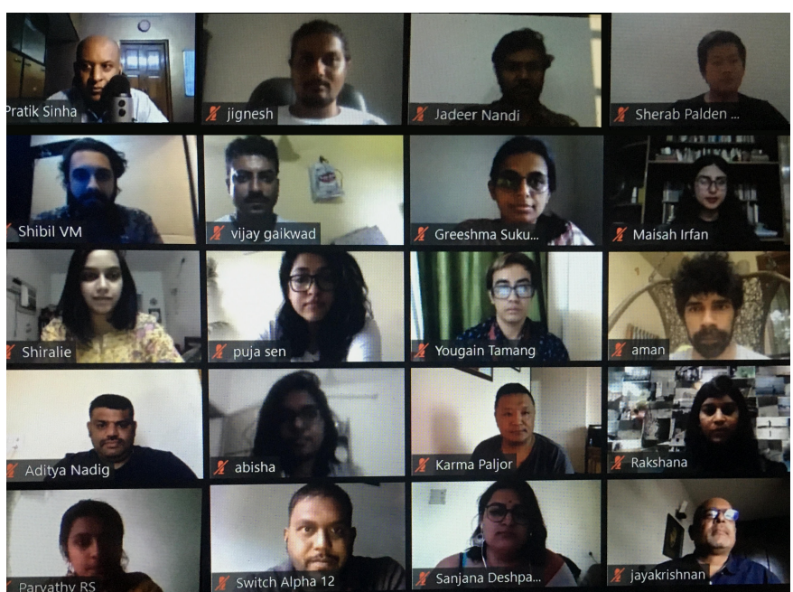
Participants during the IPSMF - Alt News fact-checking workshop on June 24-25, 2021

While India continues to fight the spread of the novel Coronavirus, which has unleashed a never-before health crisis, what has gripped the country equally is the contagion of fake news. This threatens to distort the citizen's right to credible information, roil the social and political environment and threatens to instigate unwary citizens to take up extreme positions based on viral but unverified rumours and hearsay.